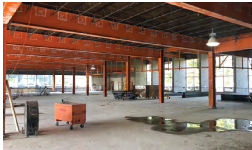
● The Great Reading Room looks nothing like its former self!

We originally planned to start construction in April, but COVID delays moved that out to June. "Barring any more unforeseen problems — like a