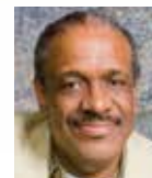
Christopher Paul Curtis